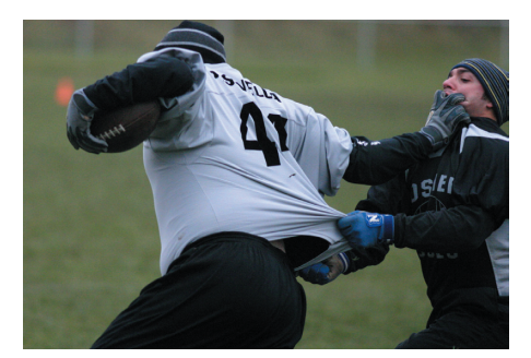
A STIFF ARM BLOCK ADDS A FEW MORE YARDS TO GAIN

The Capital District Flag Football League (CDFFL) has now grown more than five times the size and is one of the premier leagues in the nation, with over 60 teams, three separate divisions and a few National Champions. This year's championship was played in February in Irving, Texas, the home of the Dallas Cowboys and Texas Stadium.