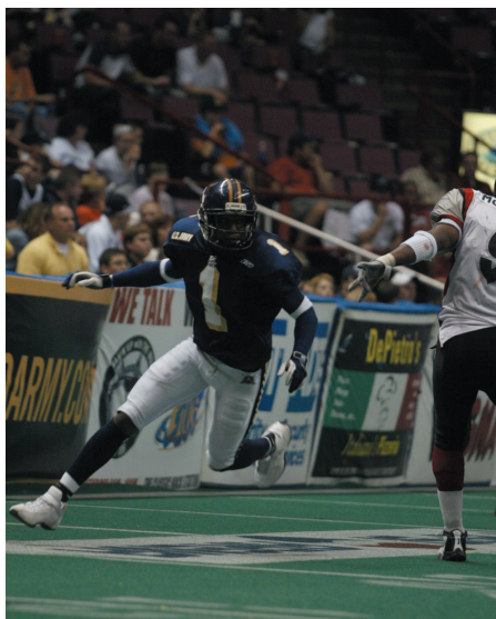
NON-STOP CONQUEST ARENA FOOTBALL ACTION.