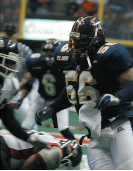
CONQUEST PLAY MONSTER DEFENSE.