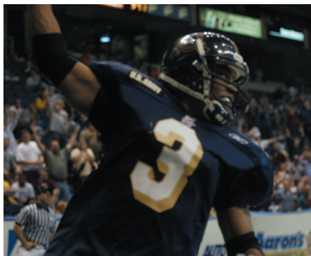
CONQUEST TOUCHDOWN AT THE PEPSI.