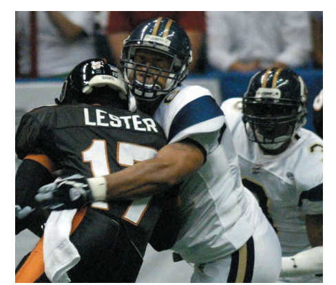
CONQUEST PLAY TOUGH D

ALBANY -- Albany Conquest fans may be a confused group today as the arenafootball2 season nears its stretch run.